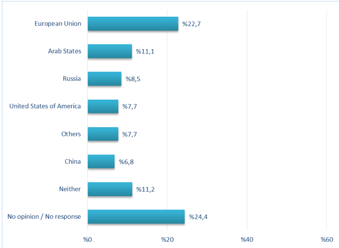
Figure 1. "The country/country groups that Turkey should cooperate with to have a stronger economy and foreign policy"

According to a public opinion survey conducted on behalf of the Centre of Economics and Foreign Policy Studies (EDAM) via TNS throughout the country, Turkey should cooperate with the European Union to have a stronger economy and foreign policy.